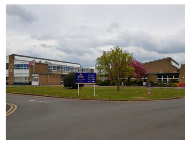
Sawtry Village Academy