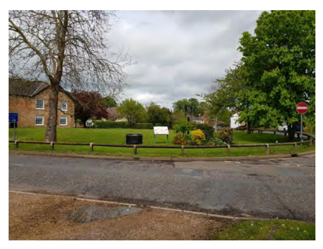
The Green forms a distinctive central point in the village