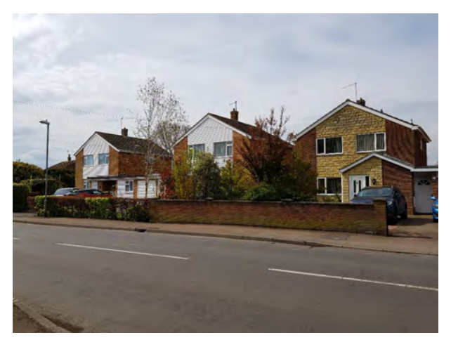
Sawtry experienced significant growth during the 20th century