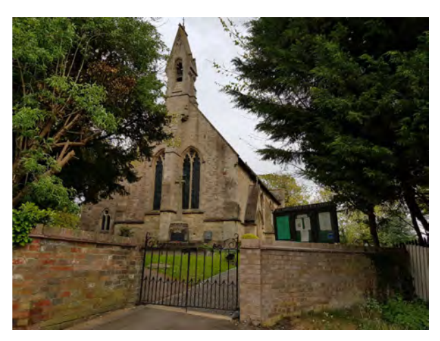
All Saints Church