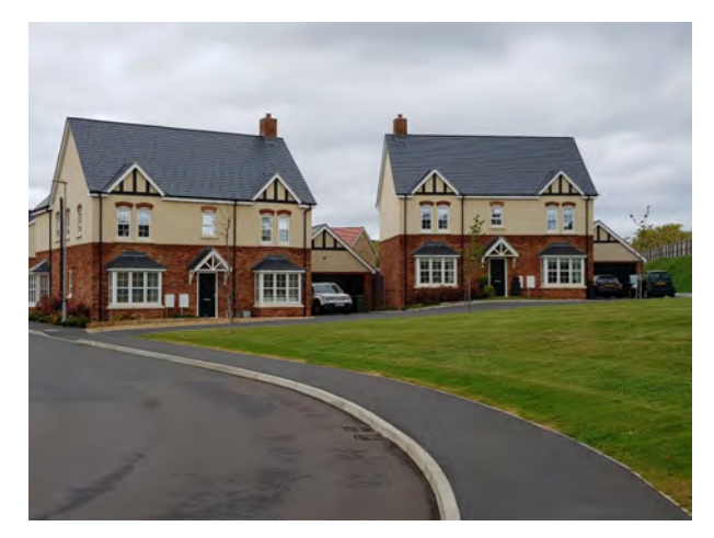
Detached homes within Haynes Close with open space