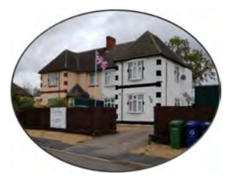
Pastel rendered properties