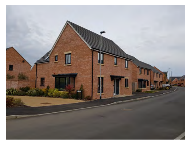
Rowell Way development has a central play space with houses looking onto it creating a strong focal point to the development