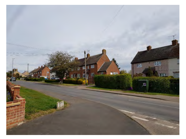
The junction between Gidding Road, High Street, Green End Road, Fen Lane and Tinkers Lane form a distinctive village centre