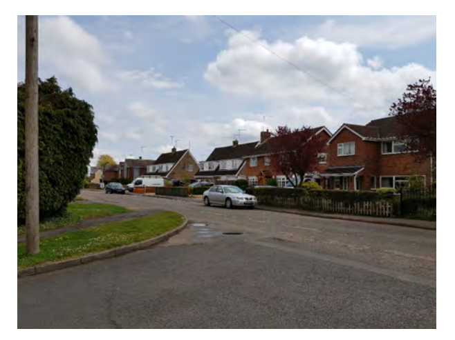
St Judiths Lane streetscene

12.57 This is a small character area located on the south western edge of the village accessed from Green End Road. It is heavily influenced by the open countryside and the rising topography and the Central Claylands landscape. Uses within this area are mixed with mixed residential properties along St Judith's Lane, Scotney Way and Holborn View; Hill View residential care home; a farm and riding school; community facilities; and recreational opportunities such as St Judith's Field and allotment grounds.