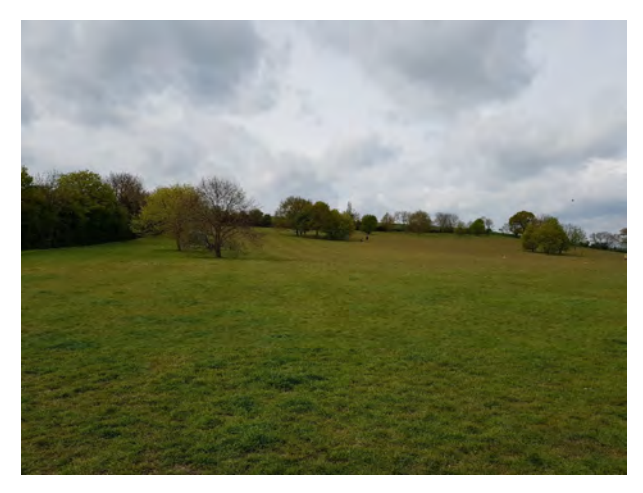
St Judith's recreation ground