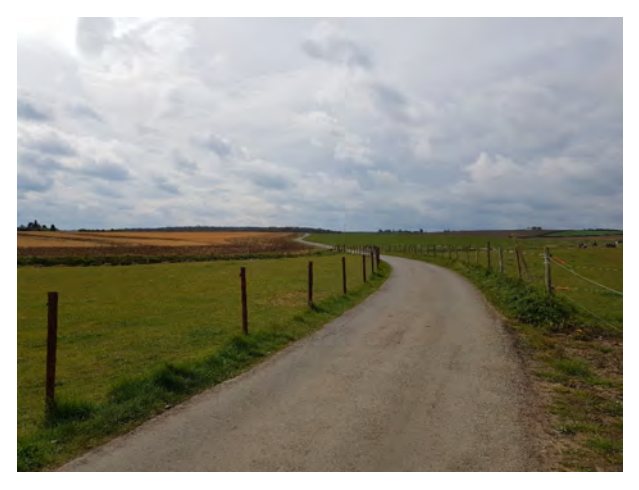
View from the end of St Judith's Lane over the Central Claylands landscape character area with public rights of way to Aversley Woods