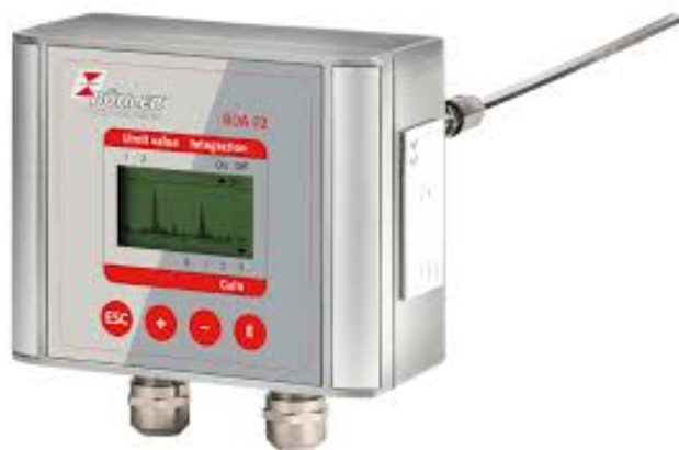
Figure 8: Bühler BDA 02 Particle Monitor.

The Bühler BDA 02 Particle Monitor (Figure 8) is a particulate monitor using a tribo-electric probe. The action of a dust particle impacting on the probe creates an electrical signal, which the monitor equates to an emission concentration.