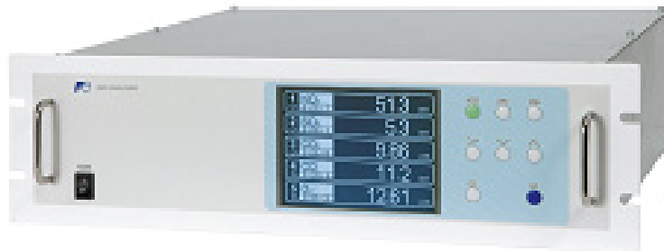
Figure 7: Fuji Electric ZPA carbon monoxide analyser.

The Fuji Electric ZPA (Figure 7) is a Non-Dispersive Infra-Red (NDIR) carbon monoxide analyser for measuring the concentration of carbon oxides (CO & CO 2 ) in dry gas conditions. It is linked to the cremator display and CEM reporting software.