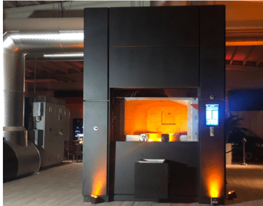
Figure 1: The DFW Electric Cremator.

The proposed cremators are single ended electric machines. The cremators will be entirely operated by electricity, and will not contain any auxiliary gas burners.