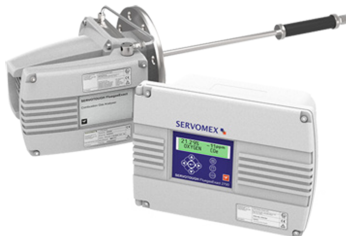
Figure 3: Servomex Oxygen Analyser.

Electrical energy will be supplied to the elements in the secondary chamber walls to maintain secondary combustion chamber temperature. Thermocouples continuously monitor secondary combustion chamber temperature to ensure that the required temperature is maintained.