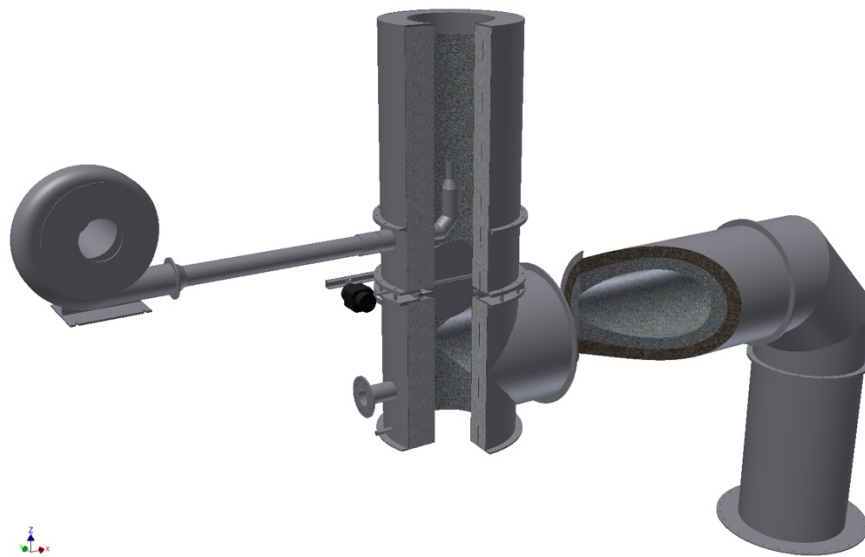
Figure 6: Emergency release vent with Injector Air Fan.

In a bypass event, the emissions from the cremator will be released to air via a separate, 450mm diameter steel emergency release vent located on the crematorium roof, directly above the cremator.