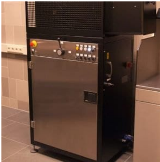
Figure 5: DFW Cremulator.

A DFW Cremulator is proposed for the for the preparation of remains after cremation.