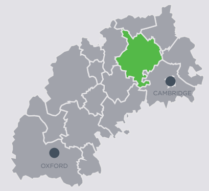
Sitting within the OxCam Arc – home to 2 million jobs and £111 Billion of Economic Output