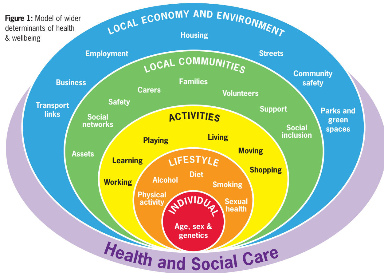
Figure 1: Model of wider determinants of health & wellbeing

Source: Modified from Dahlgren & Whitehead's rainbow of determinants of health (G Dahlgren and M Whitehead, Policies and strategies to promote social equity in health, Institute of Futures Studies, Stockholm, 1991) and the LGA circle of social determinants (Available at: http://www.local.gov.uk/web/guest/health/-/journal_content/56/10171/3511260/ARTICLE-TEMPLATE )