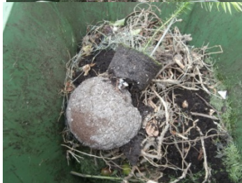
Acceptable amounts of soil