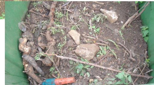
Unacceptable amount of soil

A large amount of turf is also unacceptable. If there are a few offcuts and the bin isn't too heavy to move, the bin can be collected