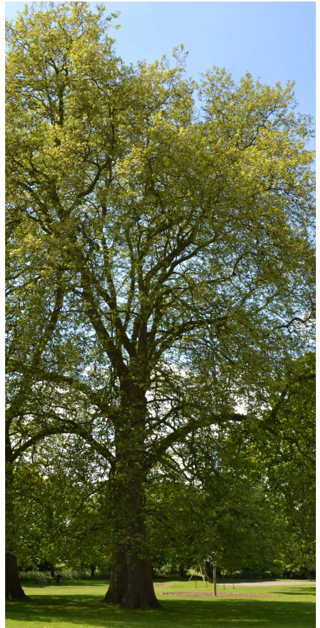
Platanus x hispanica