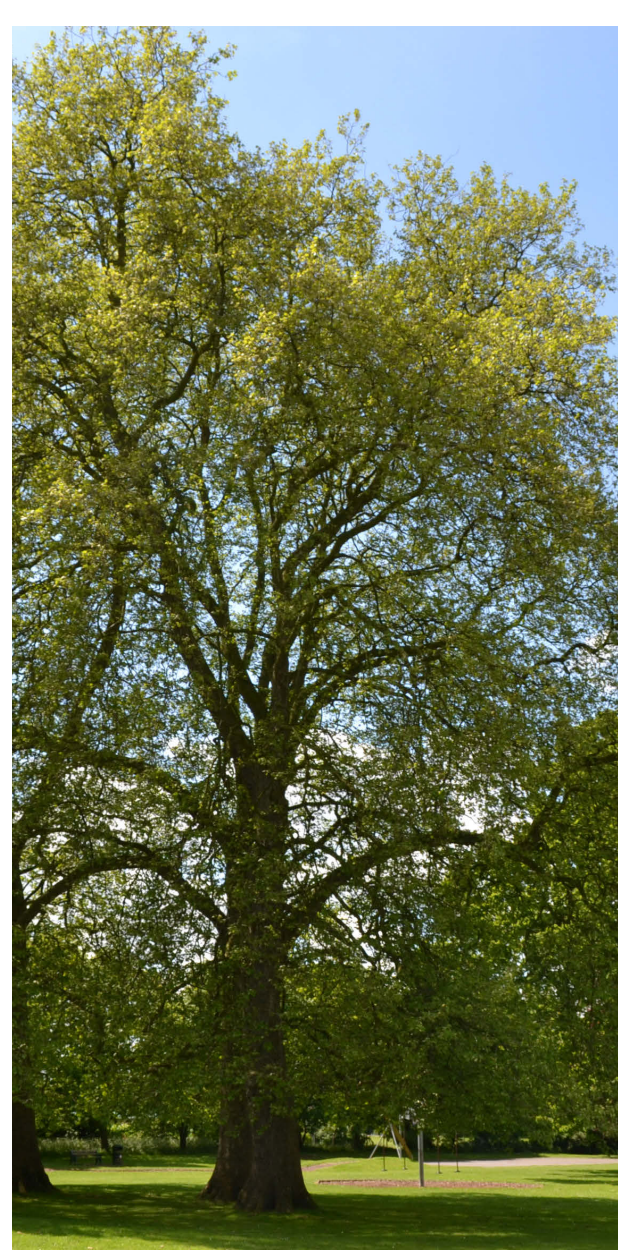
Platanus x hispanica