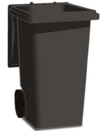
Black Bin Household Waste

Which of these things can be recycled and which cannot?