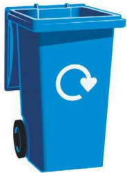
Blue Bin Recycling