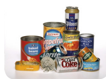
Cans & tins