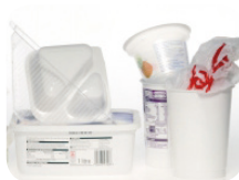
Pots, tubs and trays