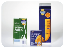
Milk & Juice Cartons