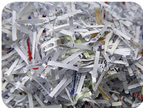
Shredded paper mixed with garden waste

If you use a container in your kitchen to collect green waste, line with newspaper, a paper towel or a paper sack to help keep it clean.