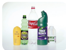
All plastic bottles