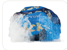
Plastic packaging including carrier bags