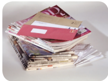
Paper, magazines & envelopes